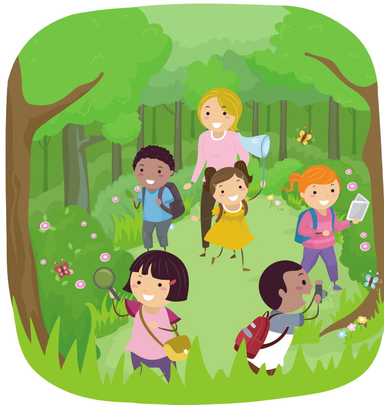
An outing to study marine or terrestrial biodiversity