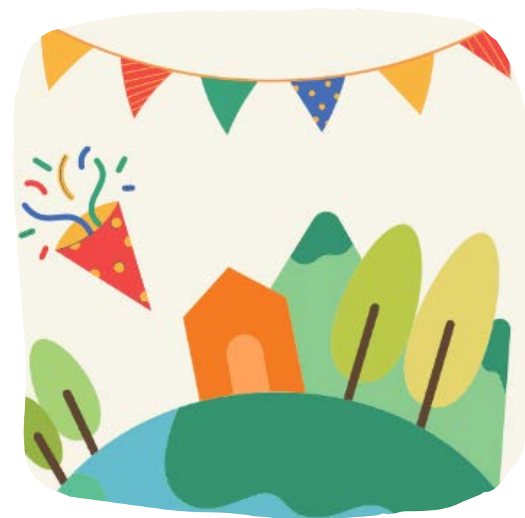
An event on nature