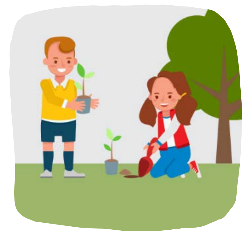
A student-led biodiversity action