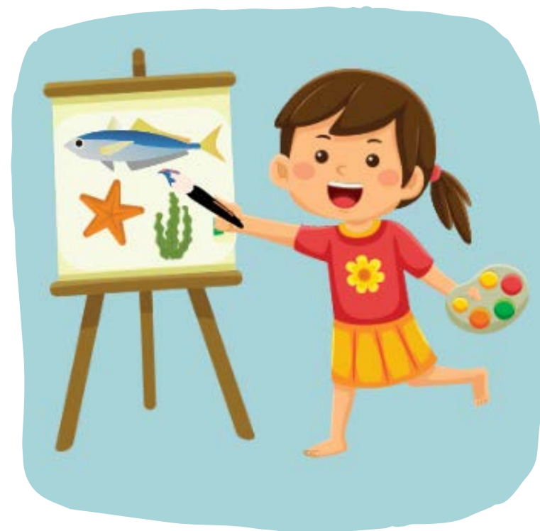
A work on an animal or plant species